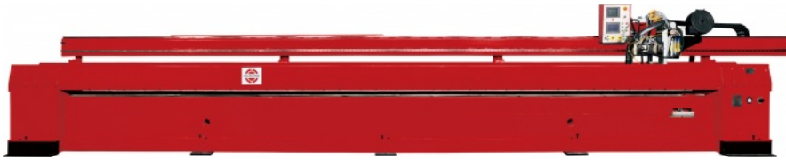
Puzzle And Inner Longitudinal Seam Series Of Welding Tooling